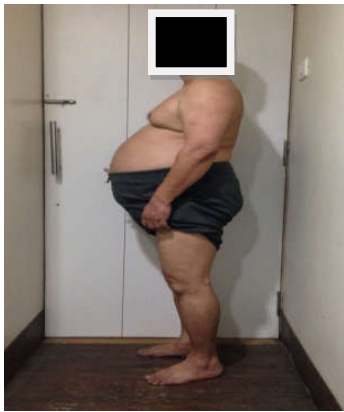
Fig. 2. Shows an overweight elderly senior with U.I. wearing an adult diaper