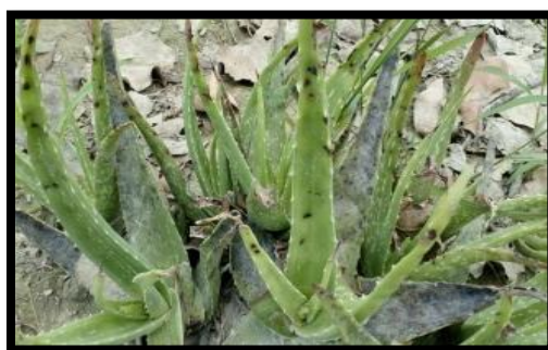
Figure. 3. Symptoms of black spots on Aloe vera plant