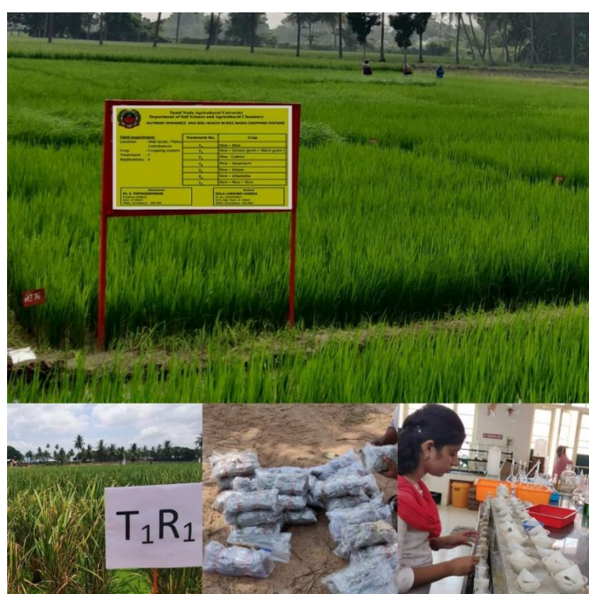
Fig. 1. Experimental area and soil samples

The present experiment was carried out and soil samples were collected from the Wetlands, Central Farm Unit, Tamil Nadu Agricultural University, Coimbatore, India during Dec 2021-March 2022, to study the physico-chemical properties of soil. The latitude was 11.00141° north, the longitude was 76.92571° east, and the elevation was 426.6 meters above mean sea level. The temperature in the study area ranges between 24 to 32.5 0 C, relative humidity is in the range of 73 to 88% and the average annual rainfall over the district varies from about 550 mm to 900 mm. The initial soil analysis revealed that soil is clay loamy in texture with 7 cropping systems replicated thrice in Randomized Block Design. The cropping systems were raised with recommended dosage of fertilizer. For all base crop i.e. , Rice 150:50:50 RDF had been adopted uniformly. The cropping system details are as follows (Table 1).