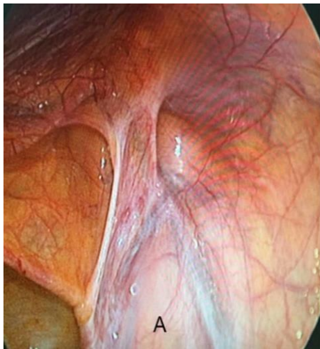
Fig. 1 A. Indirect Hernia

Finally, carbon dioxide is released, trocars are removed, and incisions are closed with sutures.