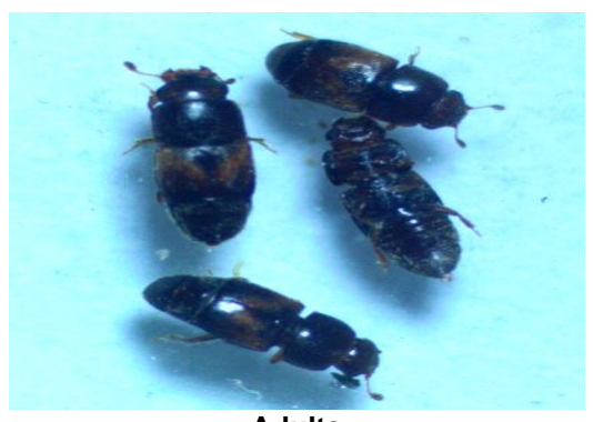
Adults Ventral view of Male (A) and Female (B)