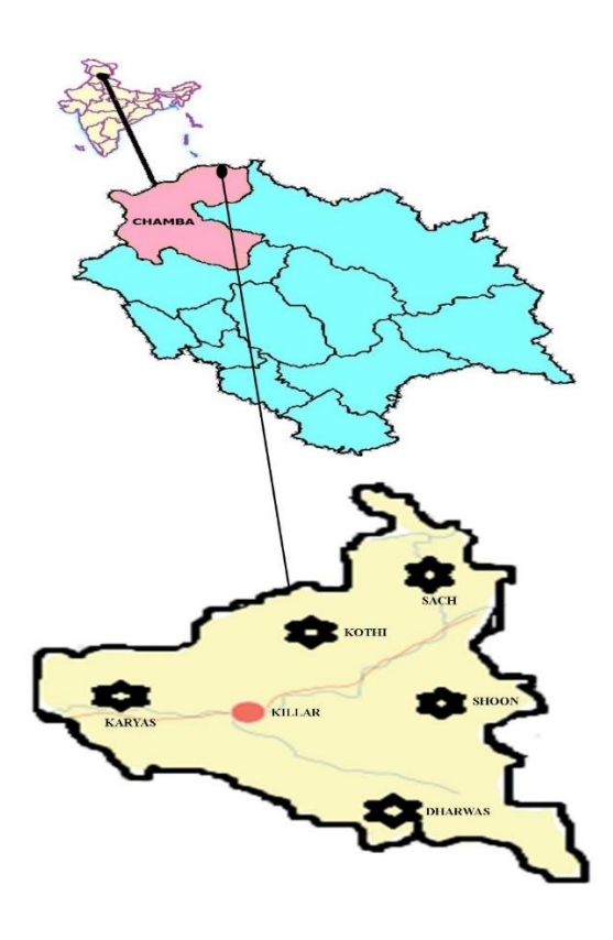
Fig. 1. Location of the study area in District Chamba (HP)