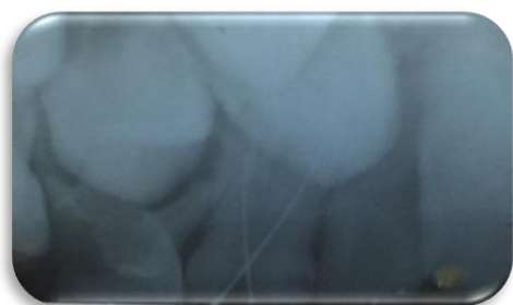
Fig. 2. Working Length determination