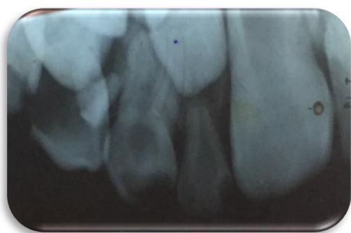
Fig. 1. IOPA with 53

Carious teeth in the upper and lower jaw were the main complaint of an eight-year-old Indian boy who presented to the Department of Pedodontics and Preventive Dentistry. There were no systemic diseases, allergies, or trauma in the child's medical history. He didn't have any siblings. A mixed dentition with several carious lesions was discovered during an intra-oral examination. Teeth 54, 64, 74 and 84 were grossly decayed. Smooth surface caries were present with 52 and 53. Periapical radiographs demonstrated a unilateral double-rooted maxillary right primary canine. (Fig. no. 1) Closer radiograph revealed the presence of two roots with 53; bifurcation was present at coronal third of root which indicates two root formations began between 9 and month's postnatally [2]. The crown of this tooth was found to be normal in shape and size during a clinical examination. As a result, there is no risk of fusion or gemination, which can result in a single bigger crown or a fused crown. In addition, this tooth has carious lesion involving labial and incisal surfaces [3].