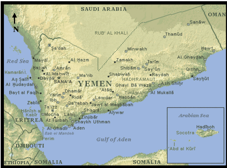
Map 1 Location

http://www.yemen-explorers.com/yemen/2009/