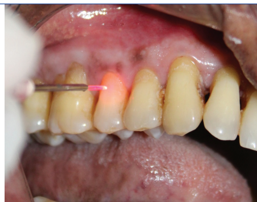
[Table/Fig-3]: Desensitisation using Denlase.