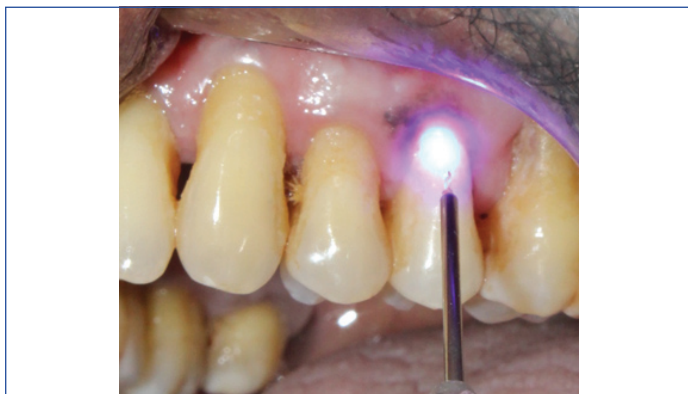
[Table/Fig-5]: Desensitisation using Blulase.

The mean age of the participated subjects was 45±3 years. A total of 12 subjects were included in the present study. Patients who presented with cervical hypersensitivity when the air was delivered against the tooth surface were enrolled in the study. No adverse effects had been observed in any of the cases during the study. The mean VAS score for the Denlase group at baseline was 8.38±1.01 and after the treatment mean value reduced to 0.64±1.27 after 15 minutes, 0.29±1.03 at one week, 0.26±0.96 at 15 days and one month with a p-value <0.001 at all time intervals which was highly statistically significant [Table/Fig-6]. Data for pair-wise comparison has been given in [Table/Fig-7]. Highly significant difference was found, when mean VAS scores were compared between baseline and all the other time points (p<0.001).