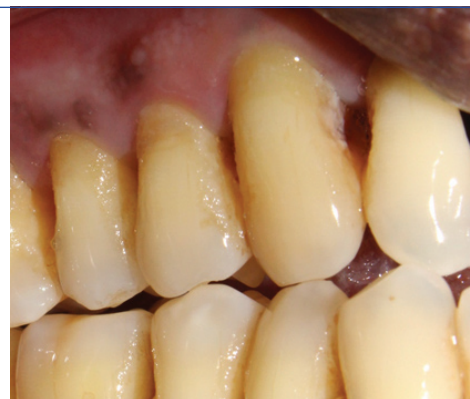
[Table/Fig-2]: Pre-op image.