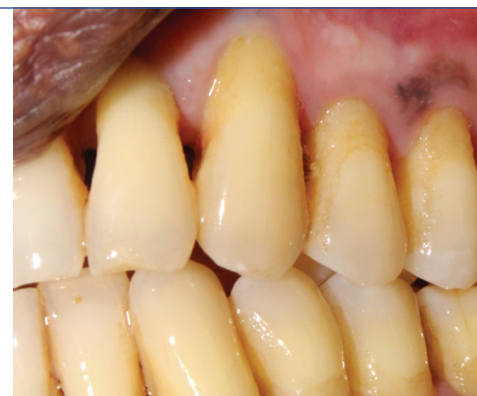
[Table/Fig-4]: Pre-op image.