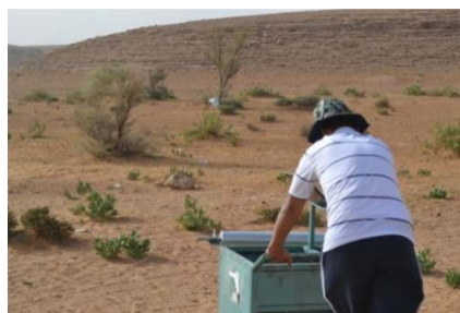
Fig. 1. The vegetation type was wild plants in the grazing areas

these samples were weighed in the field and packed in plastic bags for laboratory analysis. At the laboratory, each of the soil samples was put in an electric oven at a temperature of 105°C for 72 h. The physical properties were determined according to standard methods. Particle size distribution was analysed by sieving with different meshes. Table 2 shows the characteristics of the soil from the selected sites. The soils of the studied fields looked very similar in terms of texture. The gravel content was variable. The 12 soil samples showed the sand content was dominance (Table 2).