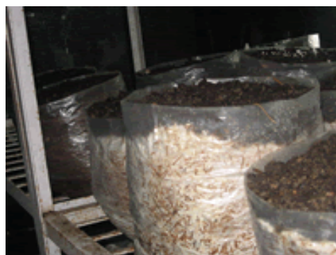
Fig. 2. Casing with black soil and farmyard manure

gases to escape from the substrate. Milky mushroom needs casing for fruit body initiation. After completion of spawn run or mycelial growth in the beds, bags were cut into two halves, opened and casing layer spread on the surface of mushroom bed at three different thickness of 15, 30 and 45 mm and sprinkled with water whenever it is necessary. These casing materials were prepared by sterilized black soil and farm yard manure. The physical characteristics of the casing material like water holding capacity (%), bulk density (g/cm 3 ), pH, EC (dS/m) and the texture of different casing materials were studied.