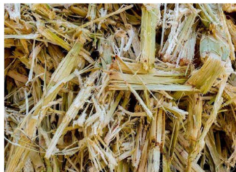
(b) Sugarcane bagasse