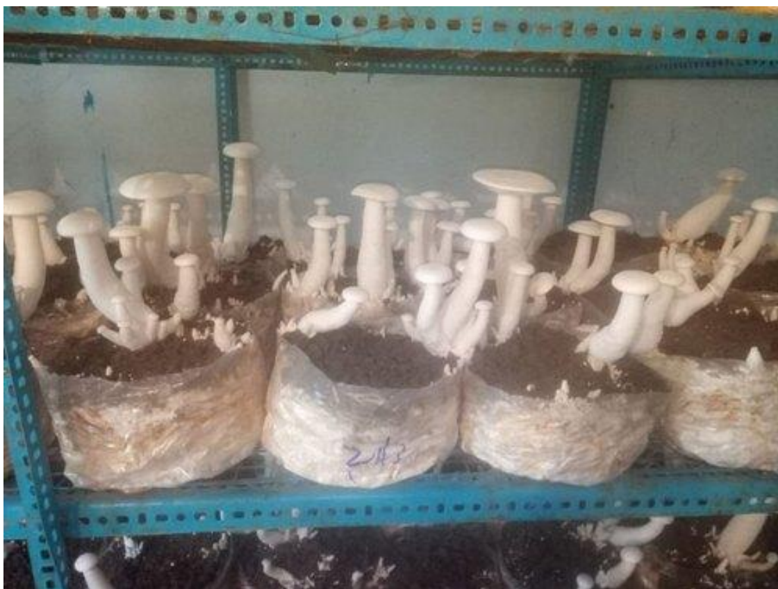
Fig. 4. Yield of milky mushroom

The total production of mushroom is 65 kg per 300 m 2 . The cost of mushroom in the market is Rs. 400 per kg. So, the total cost of production is Rs. 26,000. The net profit involved in mushroom cultivation is Rs. 9470. The benefit cost ratio was estimated as 1.57. This shows that large scale growers can efficiently use their resource to earn higher returns.