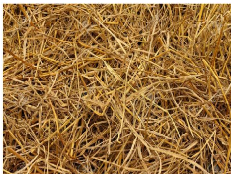
(a) Paddy straw

In order to study the effect of different substrates on the growth and yield of C. indica , an experiment was carried out with three different substrates viz., paddy straw, sugarcane bagasse and coco peat. These selected paddy straw and sugarcane bagasse chopped into 3-5 cm pieces by using grass cutter.