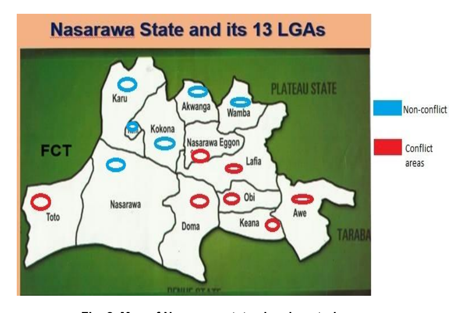
Fig. 2. Map of Nasarawa state showing study areas