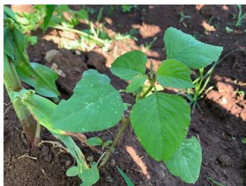
(a) Bayam Duri ( Amaranthus spinosus )