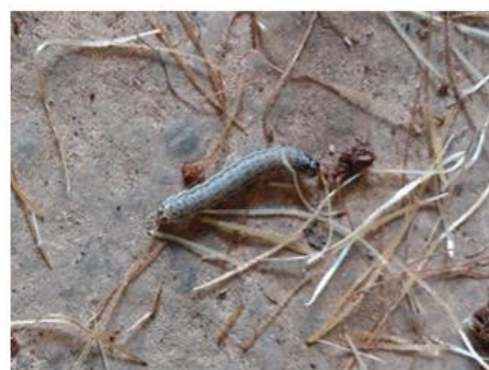
(b) Ulat Grayak ( Spodoptera frugiperda )