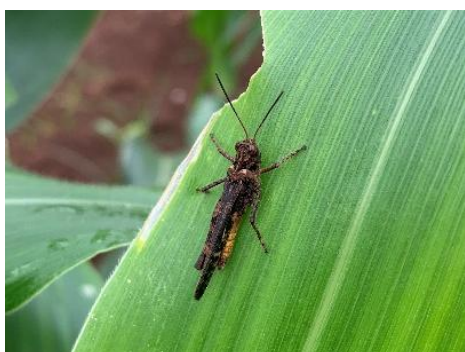
(a) Belalang ( Locusta migratoria )

Source: Padjadjaran University Climatology Station (2022)