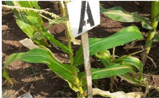
Fig. 3. Symptoms of nutrient deficiency