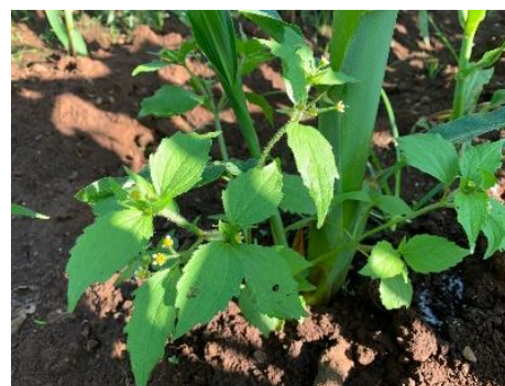
(b) Bribil ( Galinsoga parviflora )