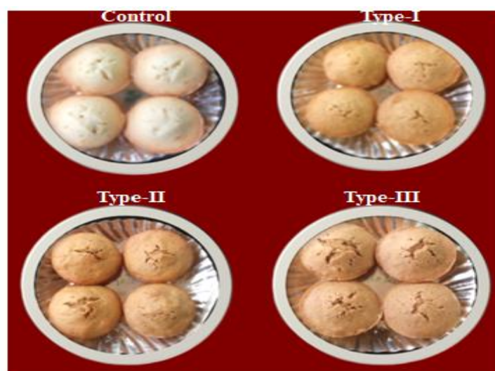
Plate 1. Garden cress supplemented muffins

The prepared muffins were analysed for proximate composition, dietary constituents and total calcium, iron and zinc according to the methods described by AOAC [16], Furda [17], and Lindsey & Norwell [18], respectively. The sample for in vitro bio accessible calcium and zinc were determined according to Kim & Zemel [19] whereas in vitro bio-accessible iron was determined by Rao & Prabhavathi [20]. The determination of Phytic acid was done by the method of Davies & Reid [21]. Total phenol determined by the Folin–Ciocalteu colorimetric method [22] and DPPH radical scavenging activity was determined by the method of Brand-Williams et al. [23] as previously described by [24] Tadhani et al. [24].