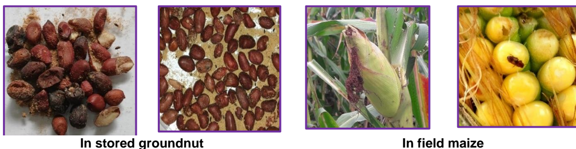
Fig. 2. Damage caused by Carpophilus dimidiatus