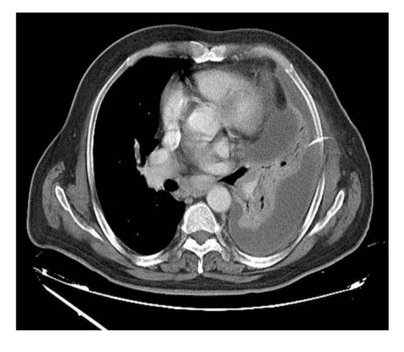
Fig. 1. CT showed loculated massive pleural fluid, multiple loculations, mediastinal lymph nodes and lower lobe atelectasis before the treatment of empyema

On pathologic examination with the H&E staining; tumor cells demonstrated the features of squamous cell carcinoma (ca) whereas pleural fluid and pleural biopsy were benign. Most of the pleural loculations were drained by tube thoracostomy; but pleural thickening and left lower lobe collapse persisted (Fig. 2). Pleural cultures were negative and amount of empyema of fluid volume was diminished in two months.