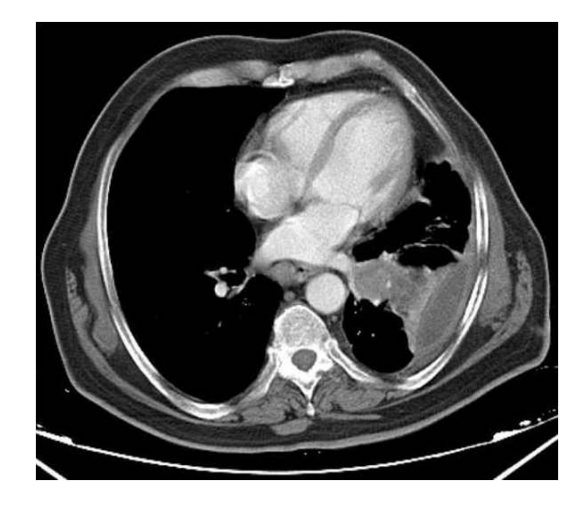
Fig. 2. Massive pleural fluidreg ressed, pleural loculations, thickening and lower lobe atelectasis were remained following chest tube and pleural irrigations

On frozen section, premediastinal lymph nodes resected by mediastinos copy were evaluated as reactive lymph nodes. As to the results; for his lung cancer settled at the left inferior bronchus, we have performed inferior lobectomy. Among the operation, it was seen that lingular segmental bronchi were originated from the left main bronchus as a variation. They were settled near the tumoral tissue. Left lower lobectomy and lingulectomy were performed with bronchial resection and the remaining apicoposterior segmental bronchus was anastomosed to the left