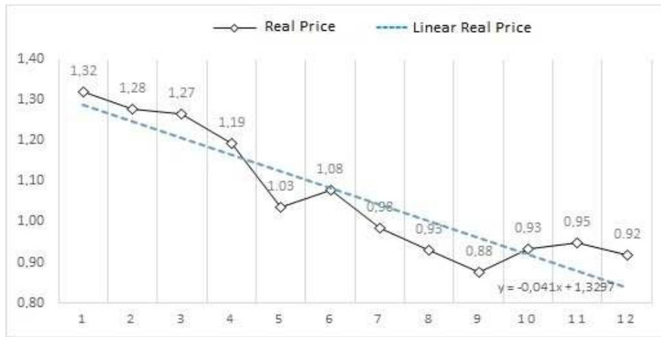
Fig. 2. Monthly fluctuations in potatoes' real prices in 2014 (TL/Kg)

The annual average of potato real prices between 2005 and 2014 were presented in Fig. 3, and an increase trend was observed in real prices during these time periods. The trend equation was found as Y = -0,041x + 0,7271 .