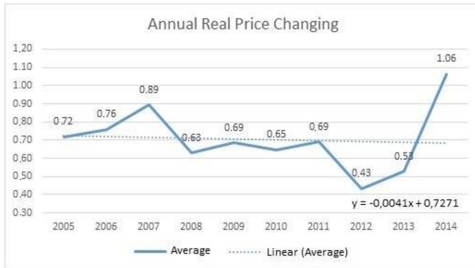
Fig. 3. Annual average real price trend between 2005 and 2014 (TL/Kg)