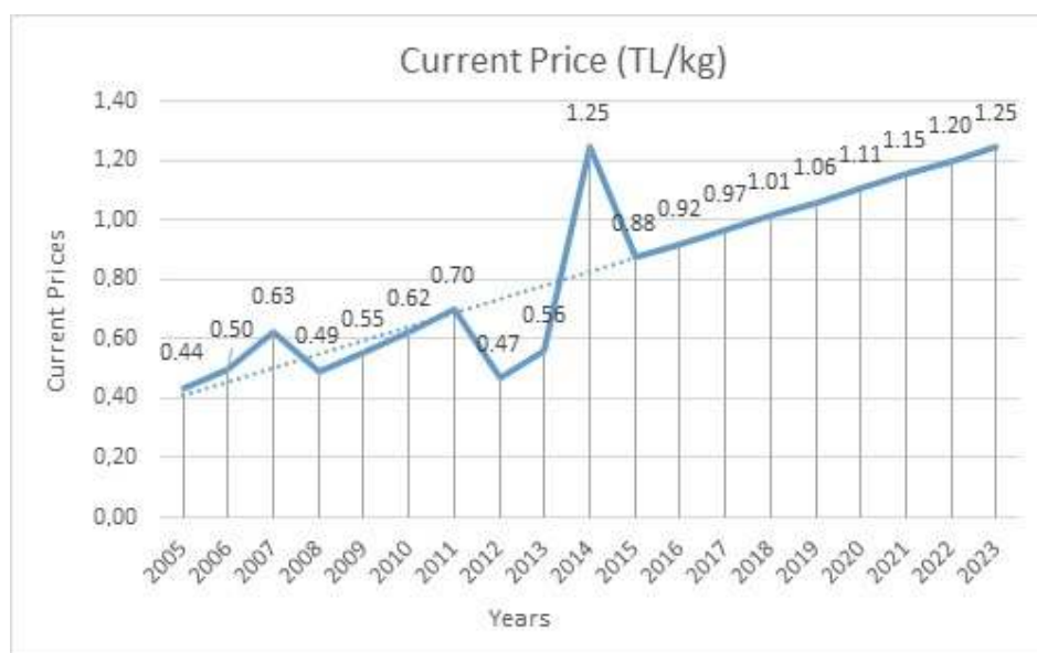
Fig. 4. Annual current prices and projections (TL/Kg)

Even though this situation seems profitable in terms of potato producers, it is a concern in terms of consumers and the country's self sufficiency. This situation should be taken into consideration when planning future agricultural policies.