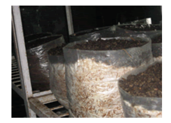
Fig. 2. Casing with black soil and farmyard manure

gases to escape from the substrate. Milky mushroom needs casing for fruit bodv initiation.After completion of spawn run ormycelial growth in the beds, bags were cut into two halves, opened and casing layer spread on the surface of mushroom bed at three different thickness of 15, 30 and 45 mm and sprinkled with water whenever it is necessary. These casing materials were prepared by sterilized black soil and farm yard manure. The physical characteristics of the casing material like water holding capacity (%), bulk density (g/cm<sup>3</sup>), pH, EC (dS/m) and the texture of different casing materialswere studied.