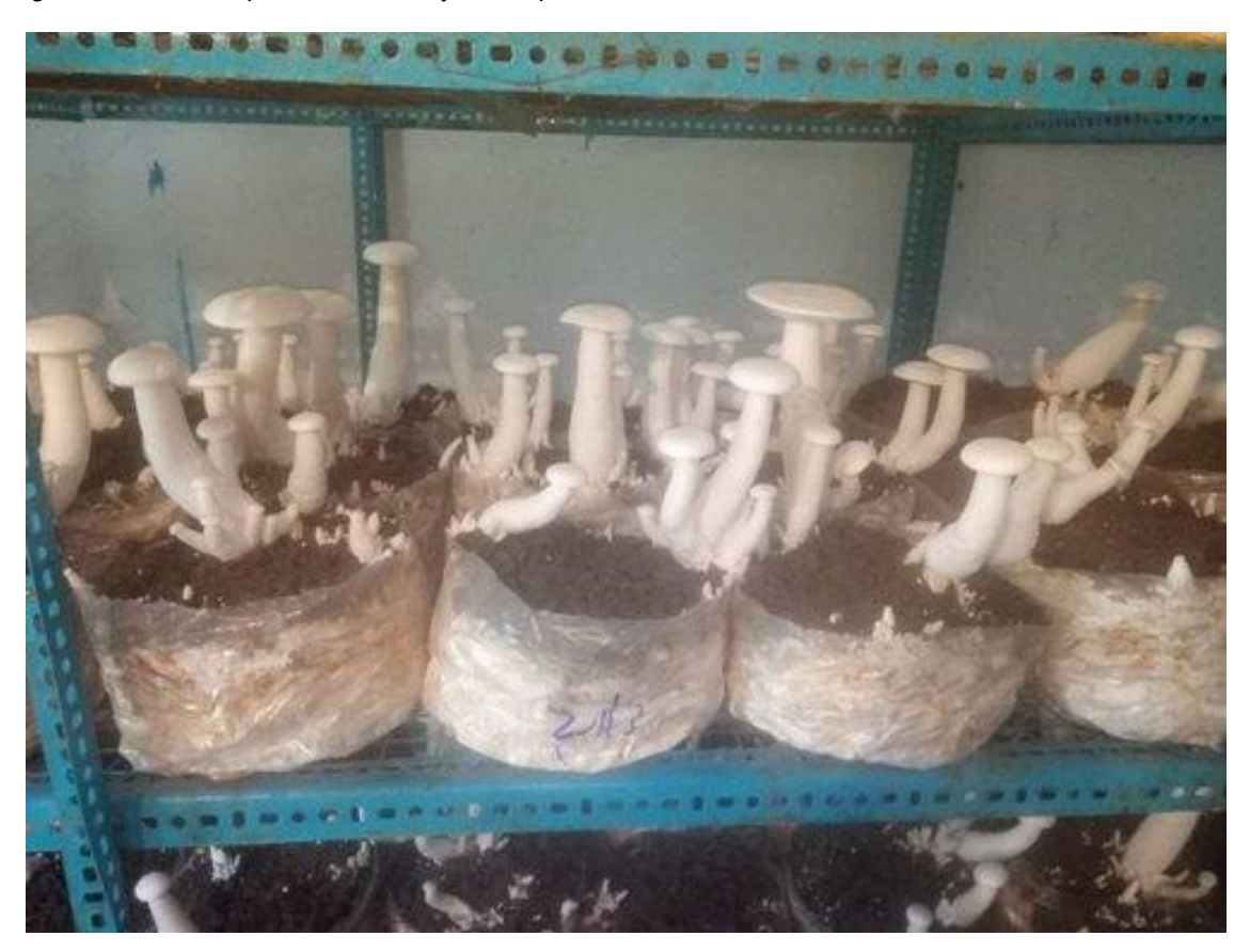
Fig. 4. Yield of milky mushroom

The total production of mushroom is 65 kg per 300 \text{ m}^2 . The cost of mushroom in the market is Rs. 400 per kg. So, the total cost of production is Rs. 26,000. The net profit involved in mushroom cultivation is Rs. 9470. The benefit cost ratio was estimated as 1.57. This shows that large scale growers can efficiently use their resource to earn higher returns.